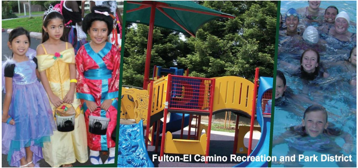
Fulton-El Camino Recreation and Park District